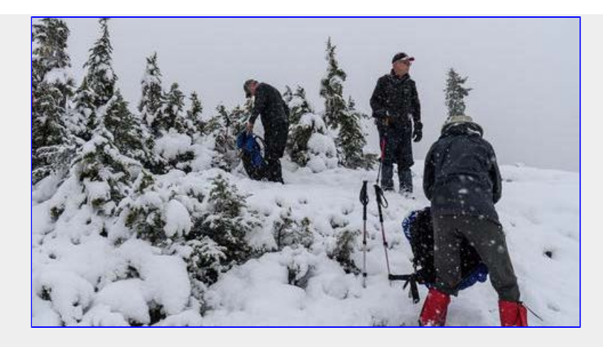
Windy, snowing and cold on the summit