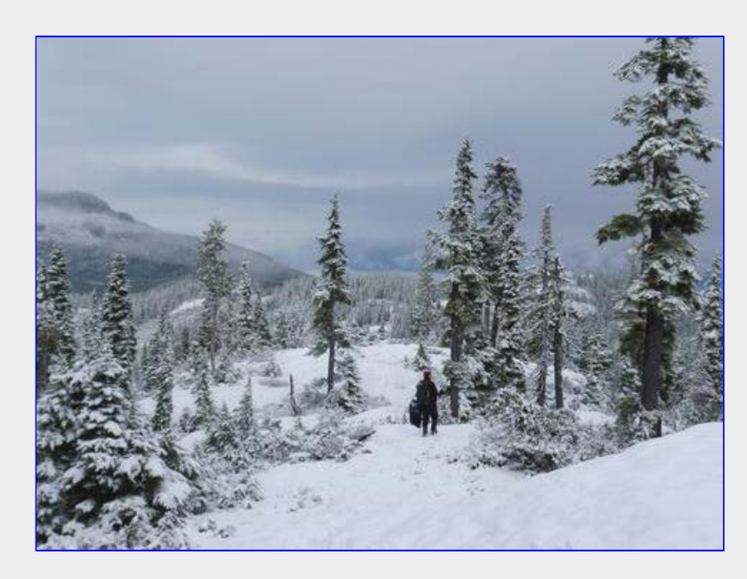
Almost back to the logging road