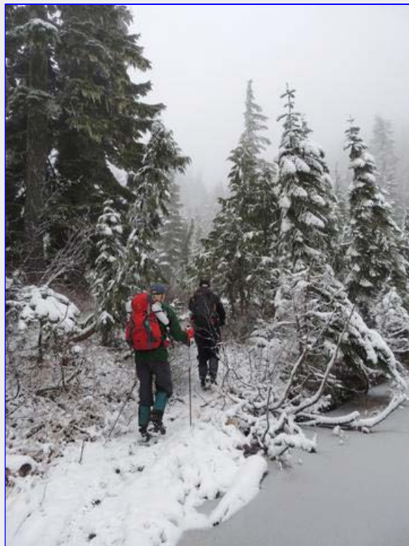
Trekking in the Snow