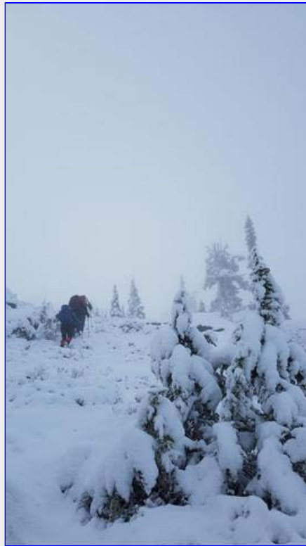
The final push to the summit