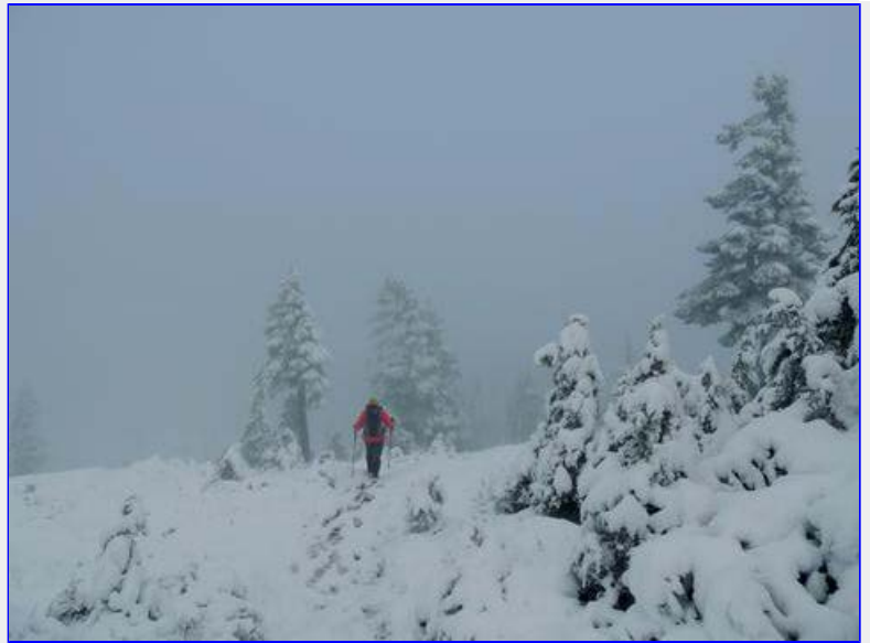
Beauty in the Higher Elevation