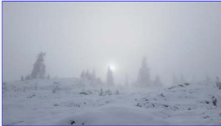
The sun came for a bit of a visit