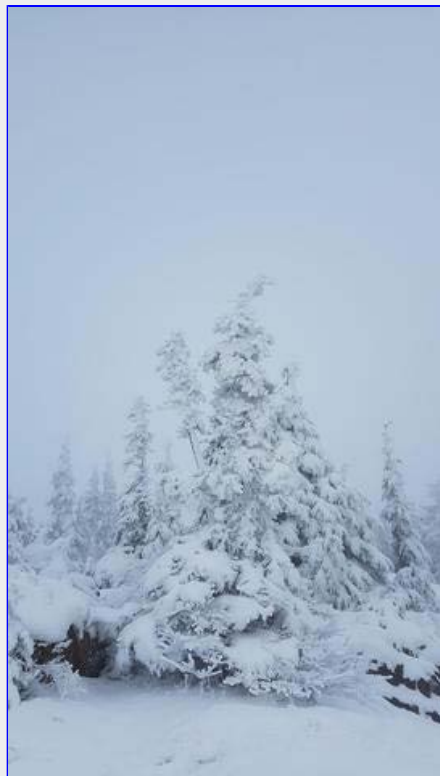
Frozen trees at the summit