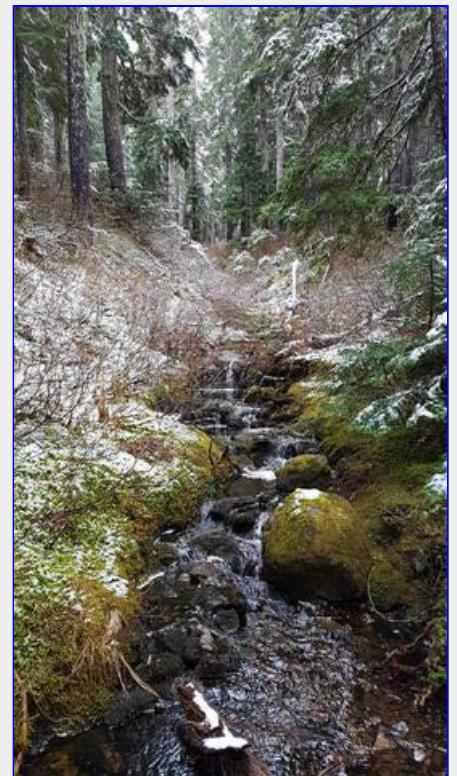
Colourful creek bed along the trail