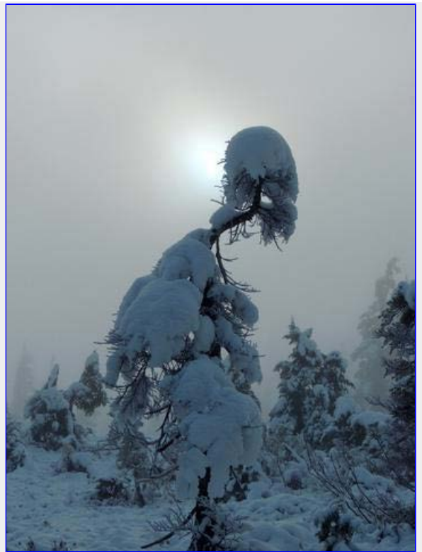
Sculpture In the Making