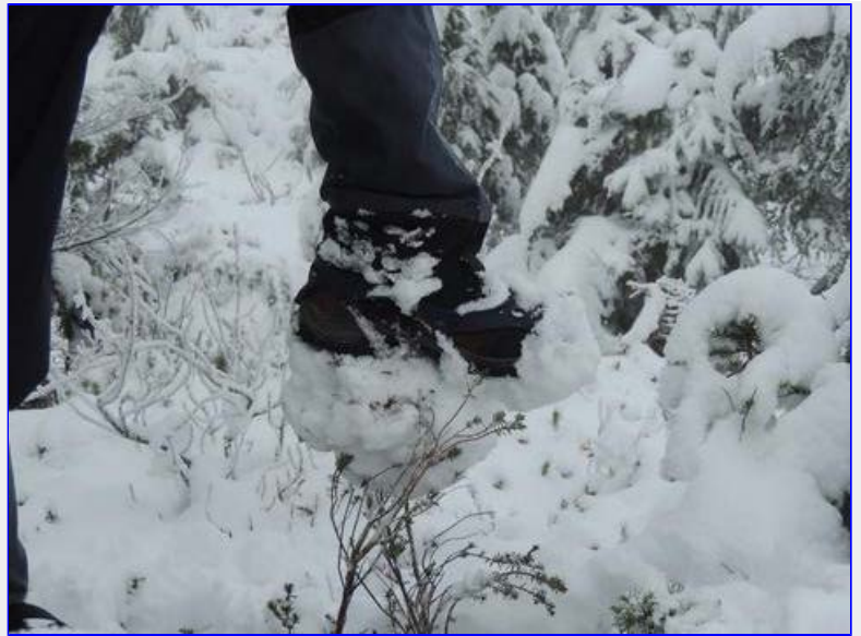
Suction Power of Hiking Crampons