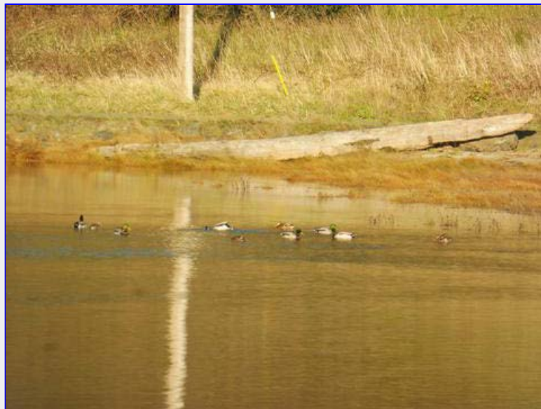
Mallards on the inside of Goose Spit