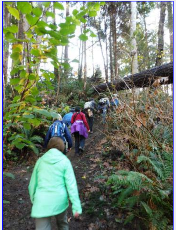
Low bridge ahead!