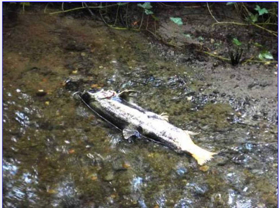
Nice to see a few salmon using the creek