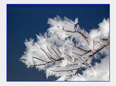
Like the down of a thistle