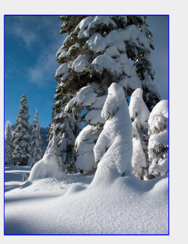
If you go down in the woods today, you'd better go in disguise