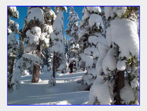
Karl approaching Croteau Lake on skis