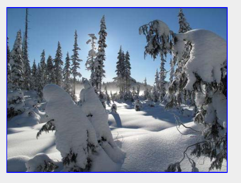
Battleship Lake approach