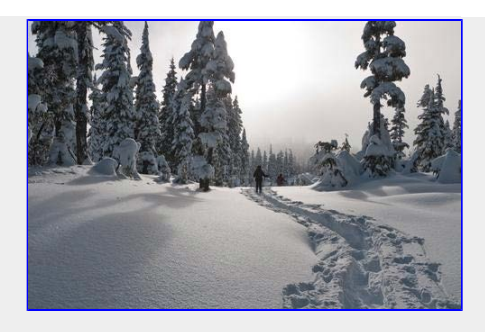
Misty approach to Croteau Lake