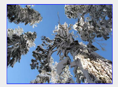
Snow everwhere