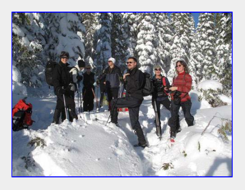
Break at Battleship Lake