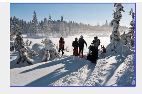
Admiring the brilliant lighting at the north end of Battleship Lake