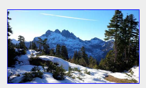
view of Triple Peak on the way down