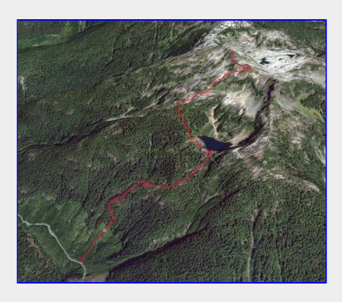
Google Earth GPS track overlay

http://public.fotki.com/TimPenney/cdmc-trips/mount-5040-november/