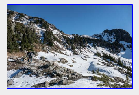
Above Cobalt Lake heading on to the summit