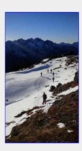
the group heading back