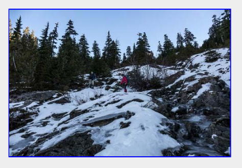
Not enough snow for snowshoes but crampons were essential for the icy conditions