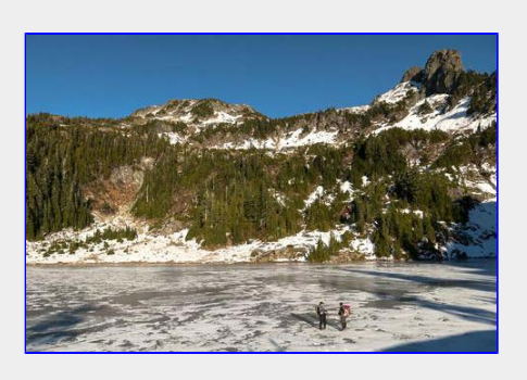
Enjoying a stroll on frozen Cobalt Lake