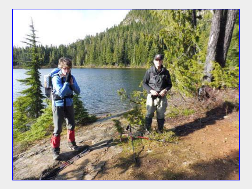
Mostly sunny for our lunch at Croteau Lake