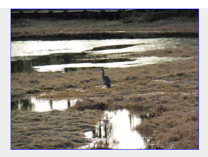
Unusual visitor in the meadows