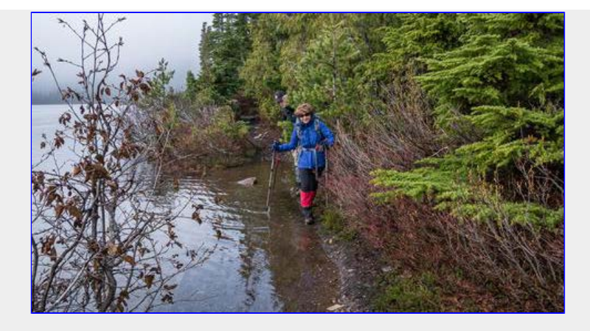
High water on the trail alongside Helen Mackenzie Lake