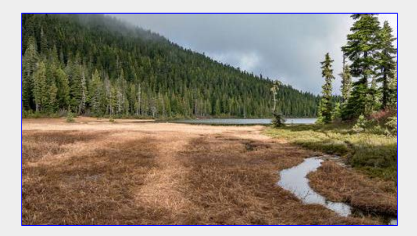
Grassy meadows at the south end of Lady Lake