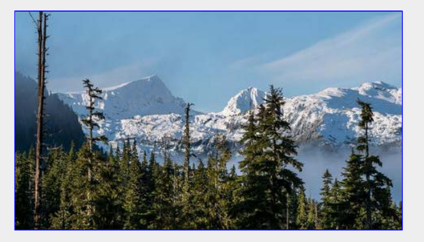
Blue skies and clear at the trailhead

We walked 15km. We were out for 5 hours with stops included. Great day for all. No rain, just muddy underfoot with the only real hazard being ice. Exercise and be silly: the cure for rainy daze cabin fever.