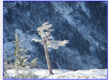
Frozen Flora on the Ridge above Gem Lake.