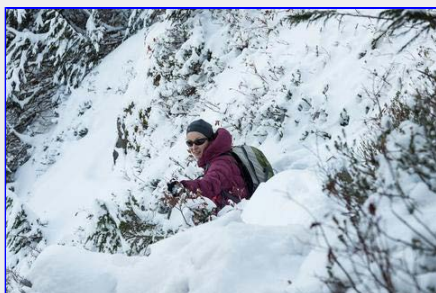
Heading down from the ridge