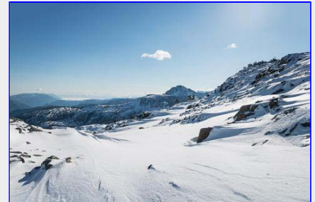
Windswept snow view of Castlecrag and the Alberni Valley in the distance