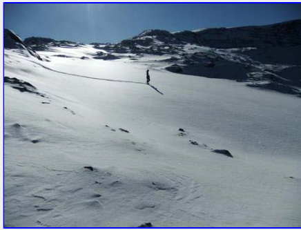
Solo Strider on the Regan Ramp.