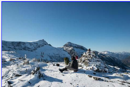
Midday summit lunch break