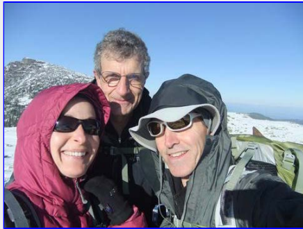
Summit Shot at the AE - Jutland Ramp Cairn.