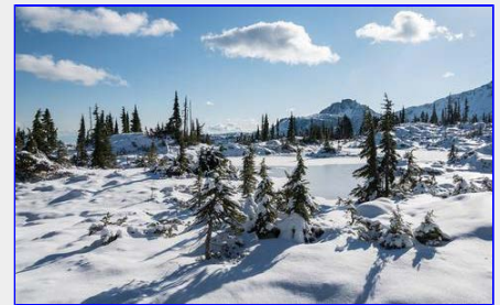
Brilliant sunny day view of frozen tarns and Castlecrag