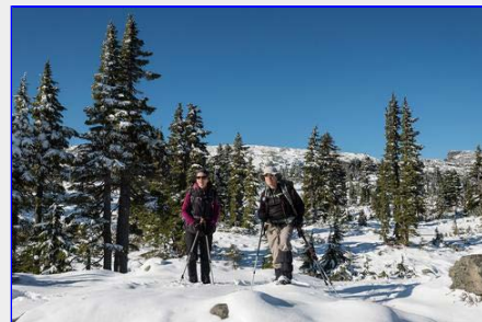
Jutland on the right and the AE ramp ahead of us