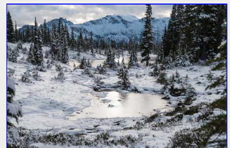
Hairtrigger Lake in the evening light