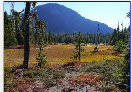
Mt. Allan Brooks + meadow colours