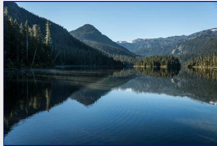
View of Strata Mountain from the north end of Divers Lake