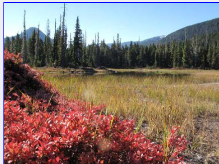
Great colours in the Meadow