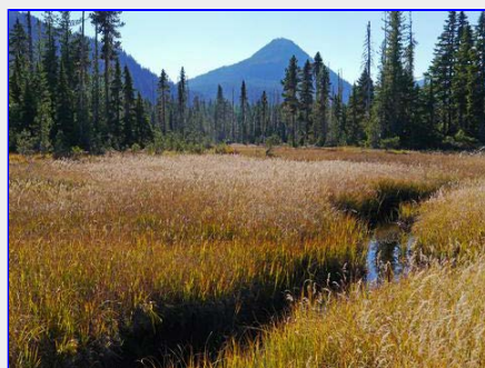
Strata Mountain + meadows