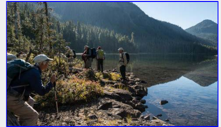
Refreshment break