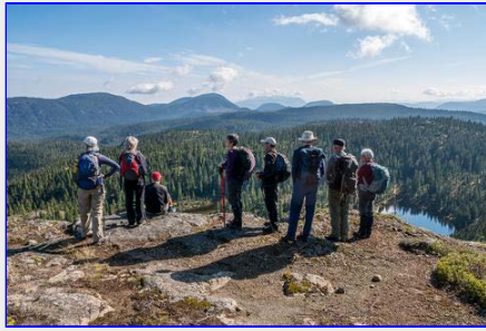
Admiring the view to Ball Lake and othe local ridges