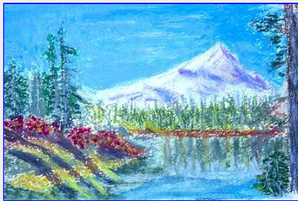
Oil Pastel Sketch at Croteau Lake