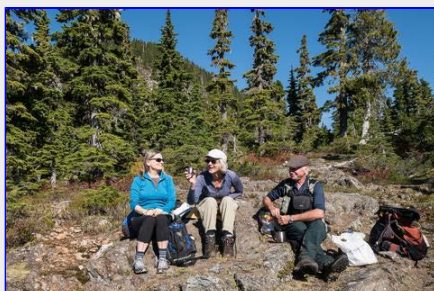
Sunny and warm lunch break