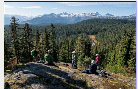
Lunchtime viewpoint