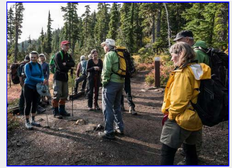
Turnoff from the meadows to Battleship Lake