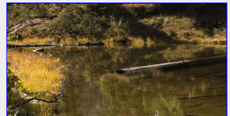
At the north end of Croteau Lake