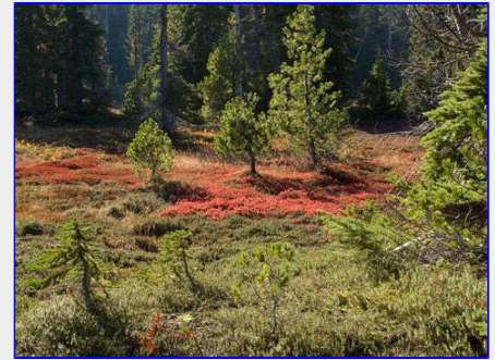
Brilliant colours at the end of the trip