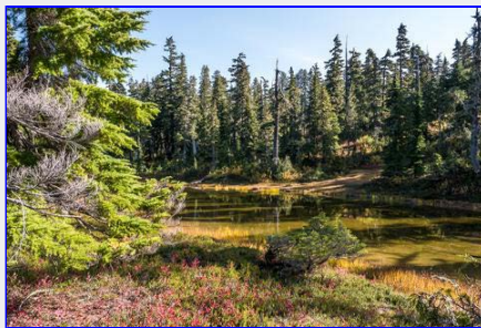
At the south end of Lady Lake