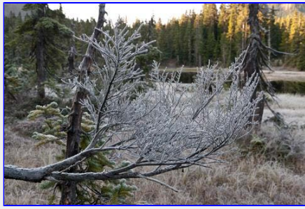
Cold and frosty start to the trip