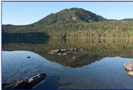
Our destination