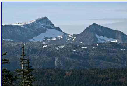
Lunchtime view shows a dusting of snow on Mount Albert Edward and Regan