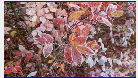
Still some fall colours in the berry bushes