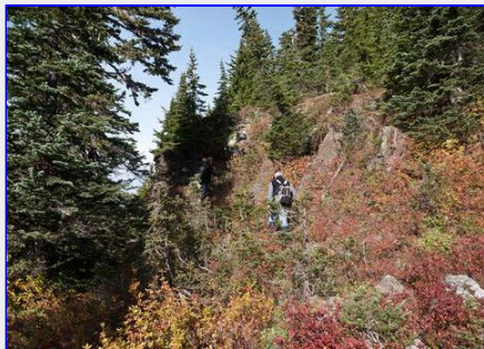
Heading up the south ridge