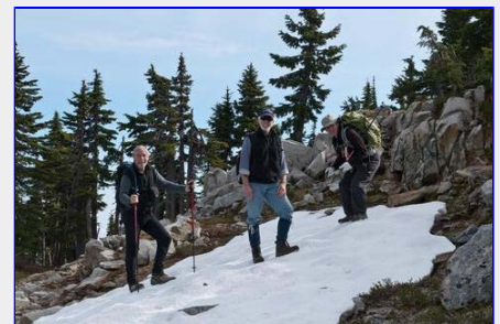
We came across one patch of snow from last winter. Snow shoes not required.