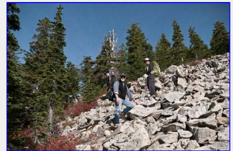
Nearly at the summit