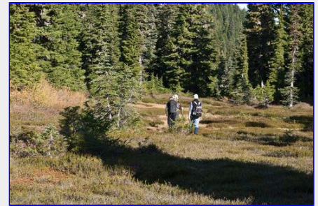
One of numerous meadows that we crossed on this trip