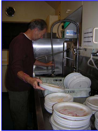
Lets just lick our plates next year!