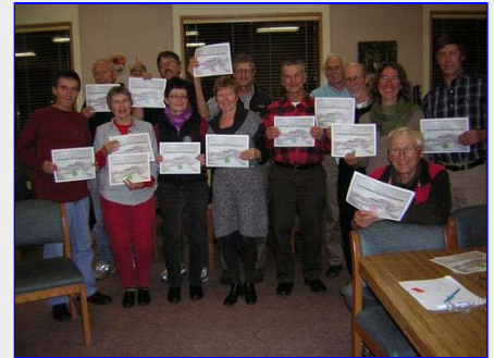
Thanks to all members who took out trips this year!