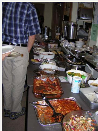
Lots of fantastic dishes!

Again, a large thank you to all those who helped with this event and continue to support our club with your presence - a wonderful evening which I much enjoyed.