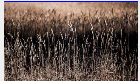
Three layers of grasses