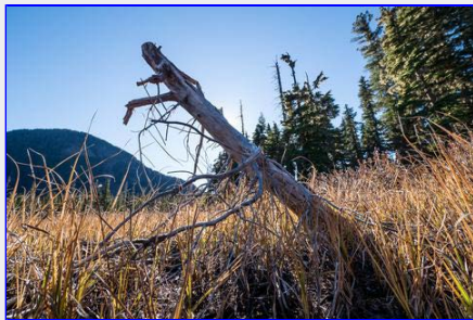
Old snag in the meadow grass