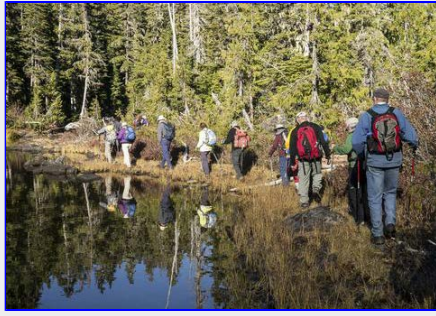
Fall Colours !