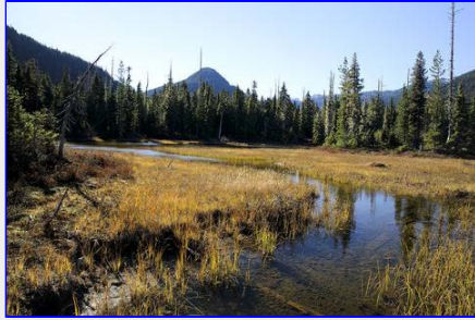
The fen with Strata Mountain