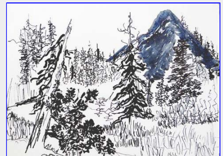
Strata Mountain in ink