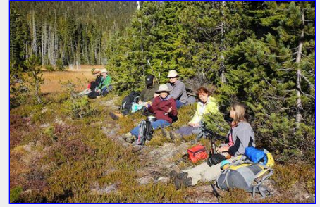
Lunch at the meadow