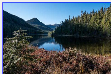
Divers Lake with a view to Strata Mountain