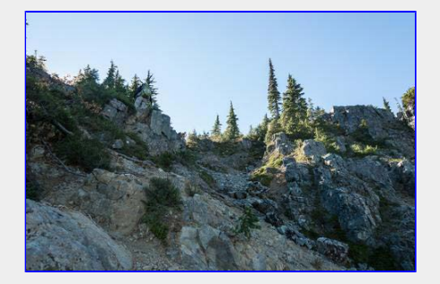
Climbing the gully towards the Half Dome summit [Tim Penney photo]

Beautiful fall colours along the trail [Tim Penney photo]