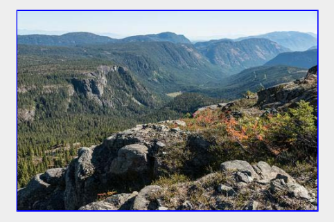
Cruickshank Canyon view [Tim Penney photo]

Lunch break view of the Cruickshank Canyon [Tim Penney photo]