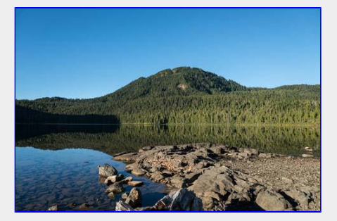
Very low water levels at Helen Mackenzie Lake