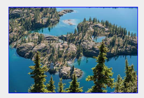
Stuart Wood Island in Moat Lake