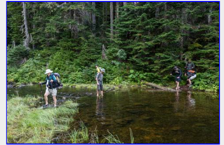
The water crossing