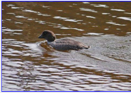
Female Goldeneye on McKenzie Lake