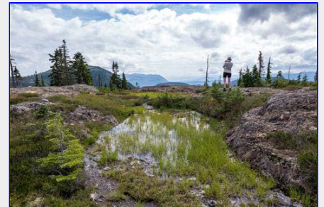
Mount Becher on the left behind the trees