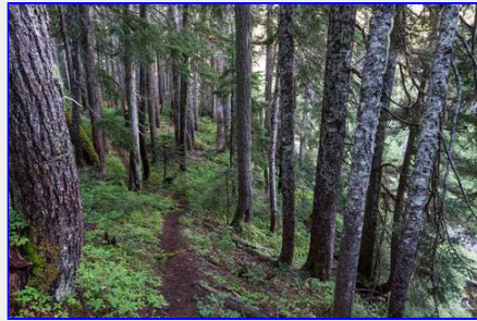
The trail to the north end of McKenzie Lake

This was one of the four trips offered by our club this weekend that had everything from fairly extreme, to very strenuous, to moderate, to very easy. This was the moderate trip and was enjoyed by us all with a special thanks again to the Well's family for the great trail improvements.