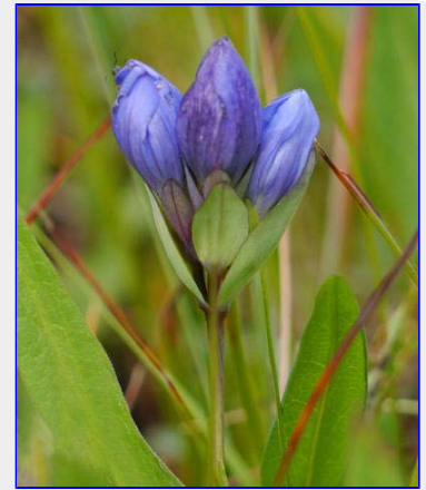
One of the abundant King Gentian (Gentiana sceptrum)