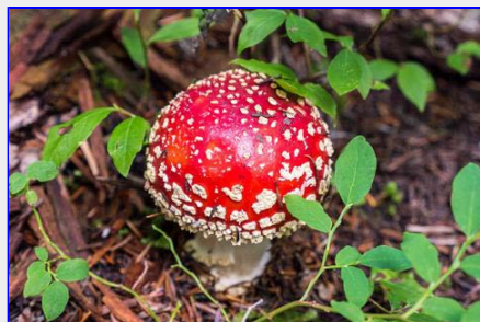
A brilliant splash of colour and a perfect Amanita specimen