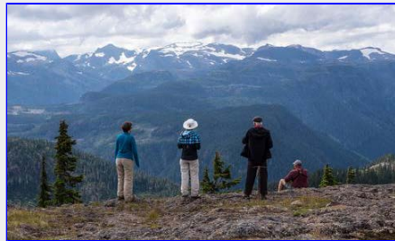
Lunchbreak area on the edge - Looking for the Glacier hikers