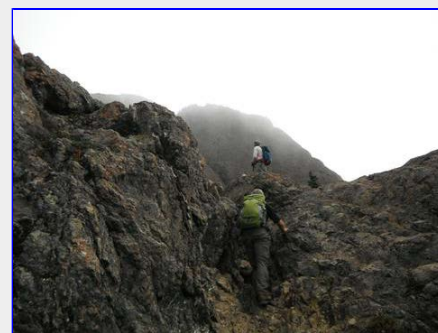
Summit Stairway