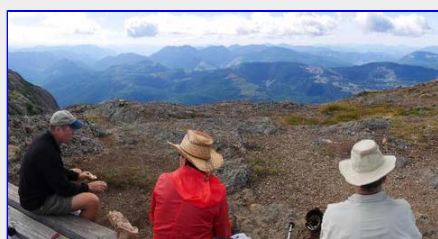
Lunch break