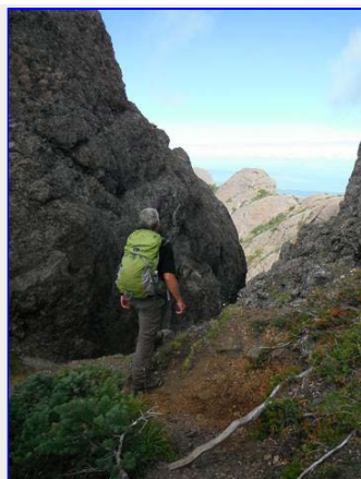
Cokely Capture amidst Summit Spires