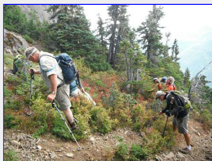
Huckleberry Happiness