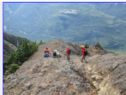
Steep trail heading down