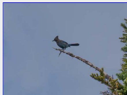
Stellars Jay