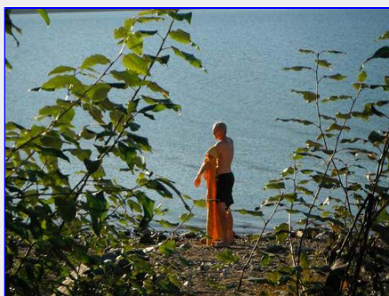
Humidex 31 Refresher