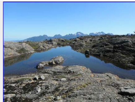
Summit Tarn 2 Laing & Filberg