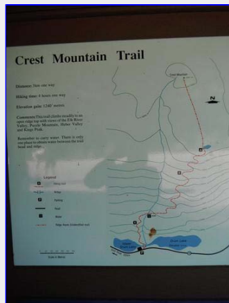
Crest Mt Trailhead Map