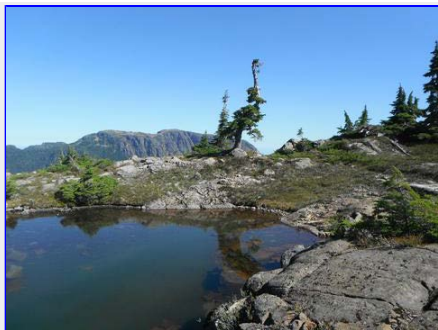
Creature Tree Fronting Big Den