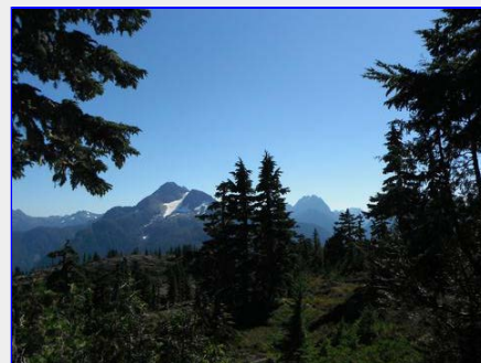
Kings & Foster