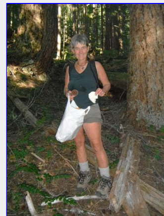
Mushroom Booty