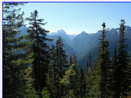
Elk River Valley