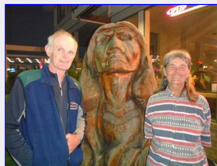
Friendly Face on Return Refuel