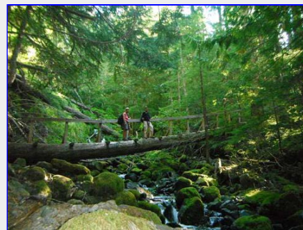
Crick Crossing