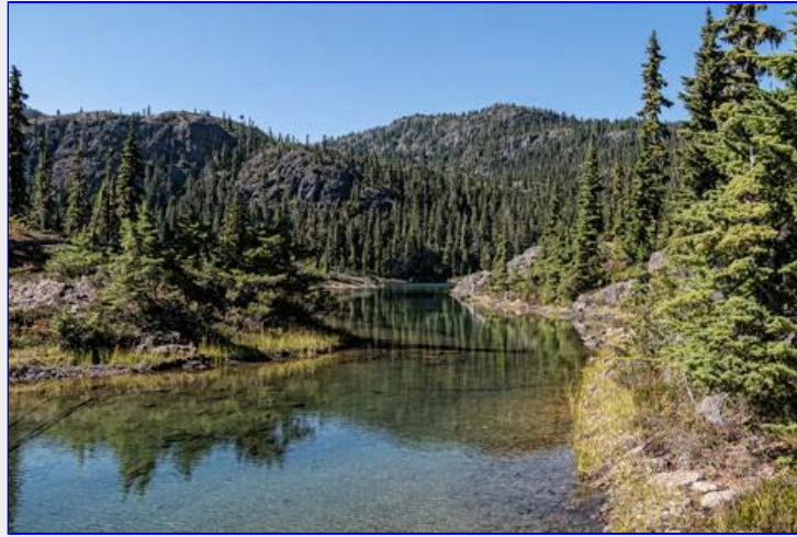
Long side channel on the lake