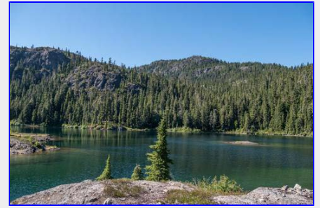
One of the lower Carey Lakes