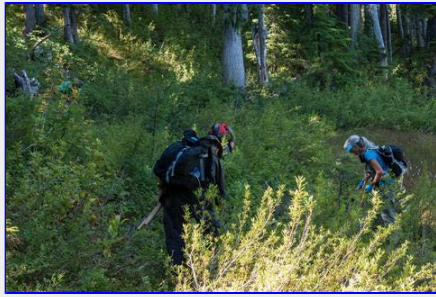
Clippers clipping