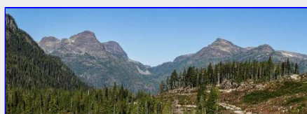
Nearly to the trailhead - George V, Frink, Albert Edward and Castlecrag