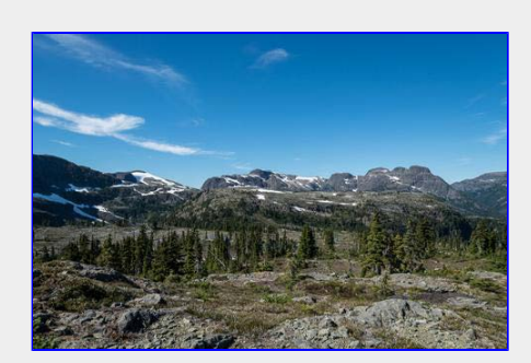
View from the plateau