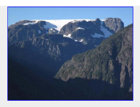
Glacier from the drive in