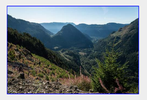
Alone Mountain in the early morning sunlight