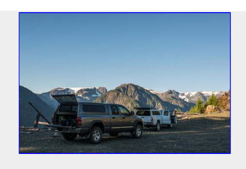
Viewpoint on the drive in