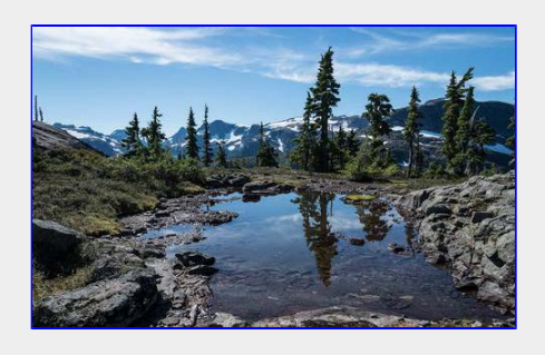
Lunch spot