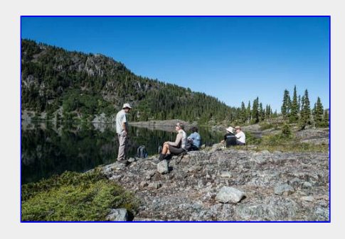
R & R at the lake