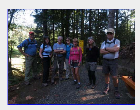
our jolly group