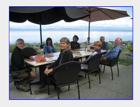
lunch time