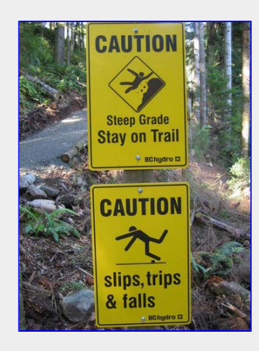
Warning! Warning!