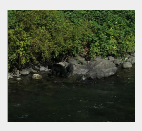
mother and cub