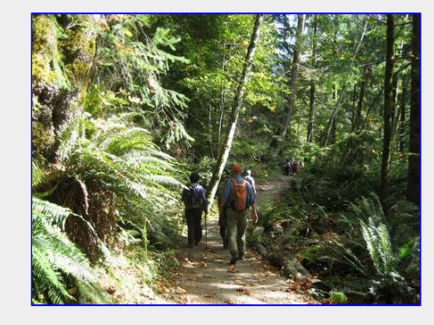
walking and talking