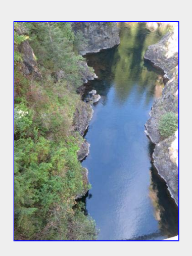
on Canyon View trail