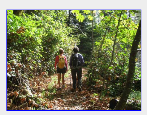
fall leaves