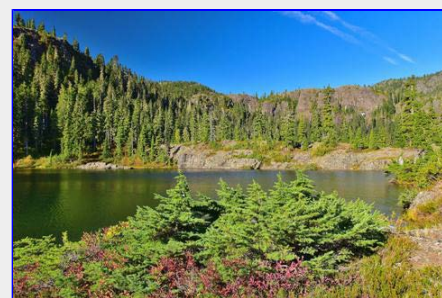
First break, and time for a few photos.....