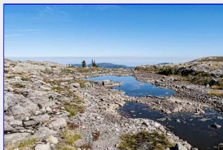
Low water in the tarns on the higher ridge