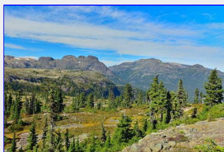
View from the top