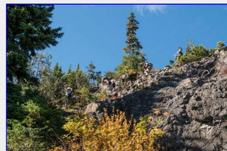
Down climbing one of the rocky sections