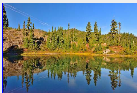
A great day for reflections