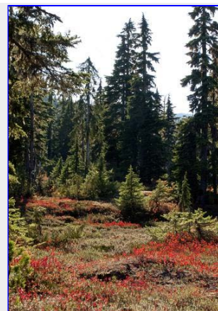
Blueberries provided lots of colour and tasting!