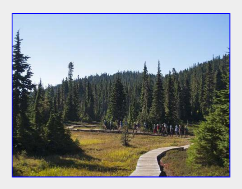
We started out together