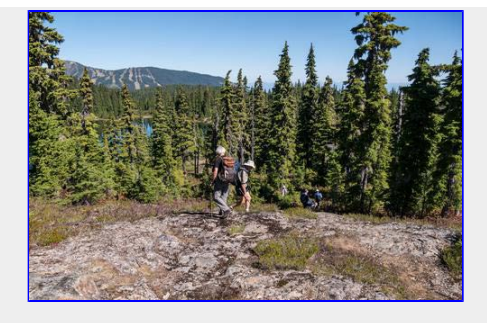
Heading back down to Croteau Lake after lunch