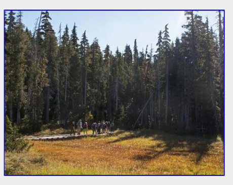
And they're off!