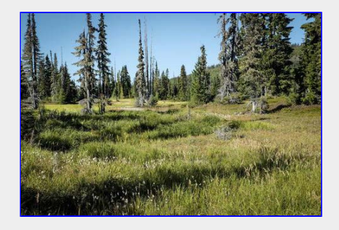
Paradise Meadows with a hint of Fall