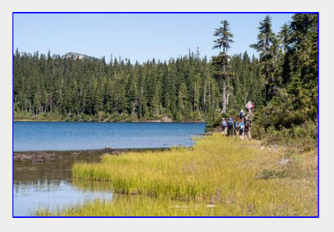
Lakeside trail around Lady Lake