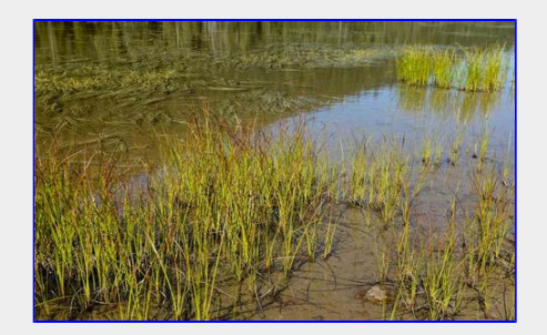
Lady Lake Grasses