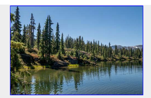
Ripples in Croteau Lake courtesy of the intrepid swimmers [Tim Penney photo]