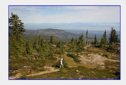
Homeward bound