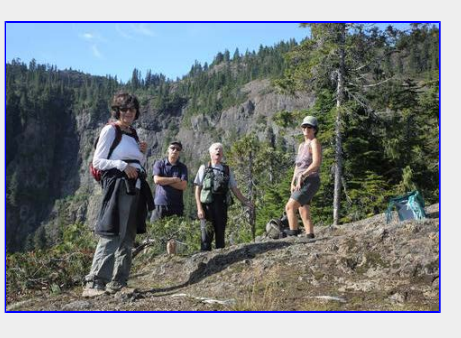
The "slow" group