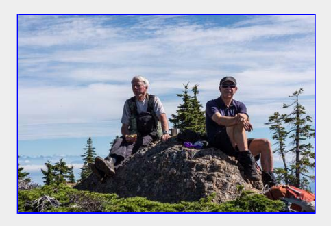
On the summit lunch break