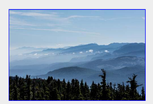
Misty ridges