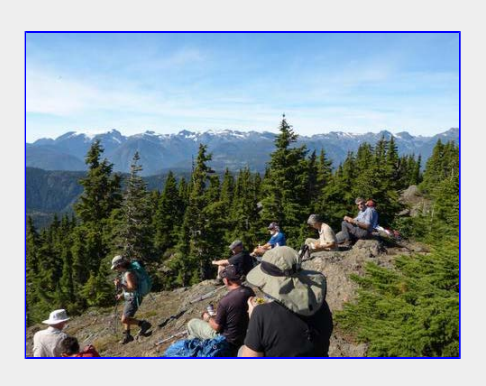
Lunch at the top