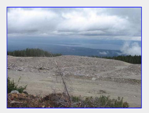
reclaimed minesite