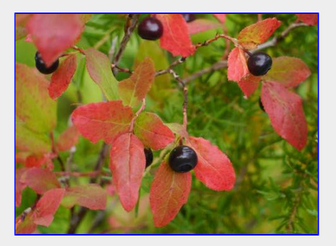
Black Huckleberry (disappeared shortly after photo was taken) [Krista Kaptein photo]

Looking into the Pit [Krista Kaptein photo]