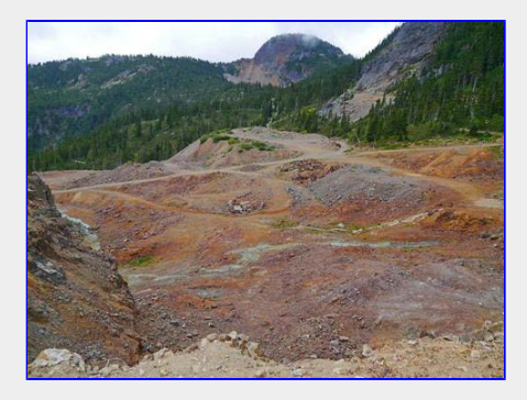
Manufactured Landscape