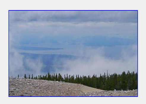
Desolation Sound, beyond desolate foreground