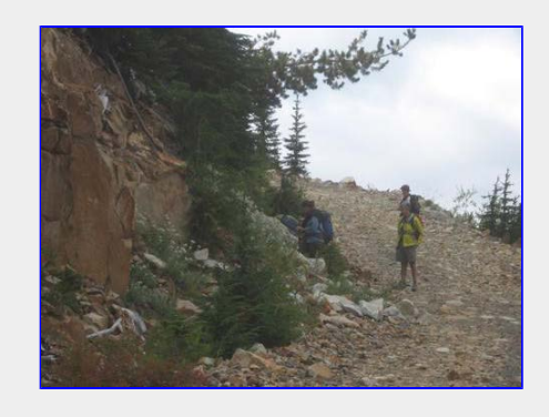
blueberry picking