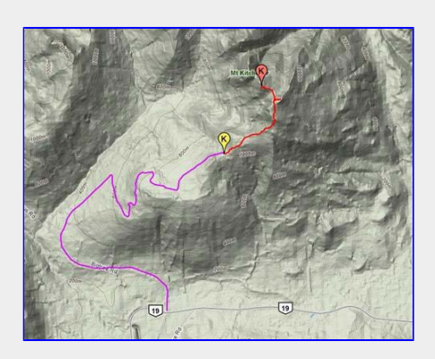
GPS track of logging road and trail

Thanks Len for coming up with this great alternate trip at the last moment.