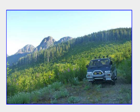
Peaks of Mt Kitchener