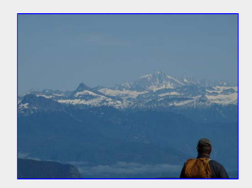
Mt Waddington