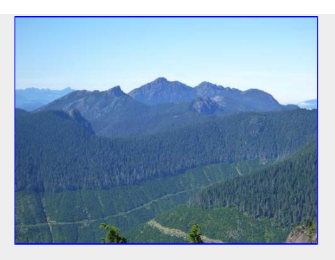
Mt Hkusam