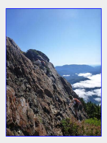
A bit of rock scrambling

So four of us piled into the Delica and drove about 40 km north of Campbell River where Big Tree Main logging road heads up the west slopes of Kitchener. About 4 of the 8 km could be done with a 2-wheel drive vehicle. The upper 4 km are cross-ditched, and require a 4X4 with good clearance. The correct fork to take at intersections is marked with orange tape or painted triangles.