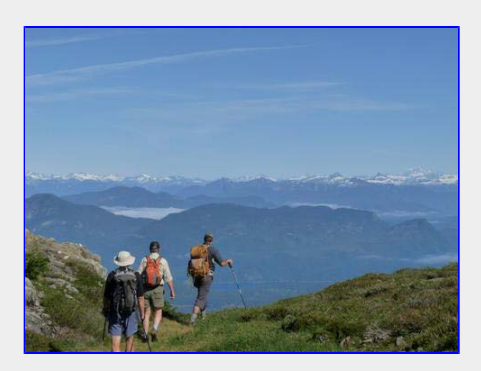
Exploring the summit