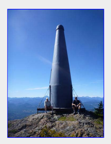
The Magnificent Three