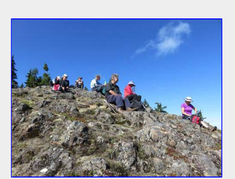
One of a few breaks