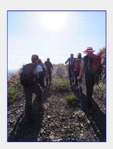
Doing a little road walking