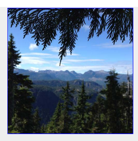
Splendid vistas