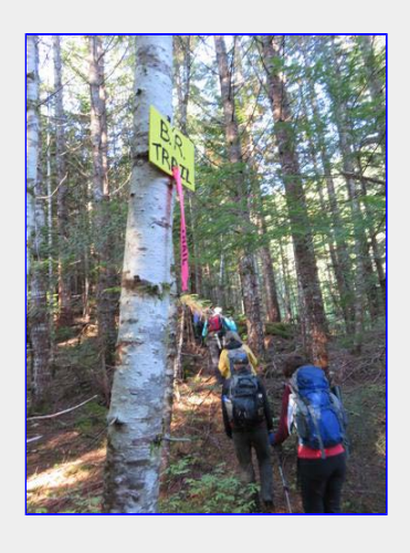
Here we go!!