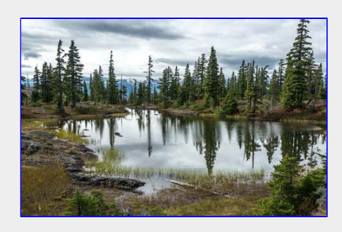
Another beautiful tarn with a view west to our local peaks