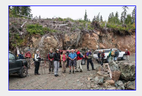
Parking area at trailhead