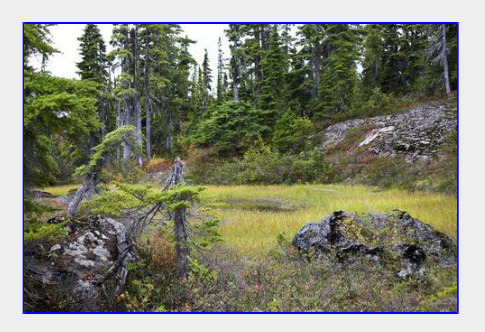
Living kruppelholtz