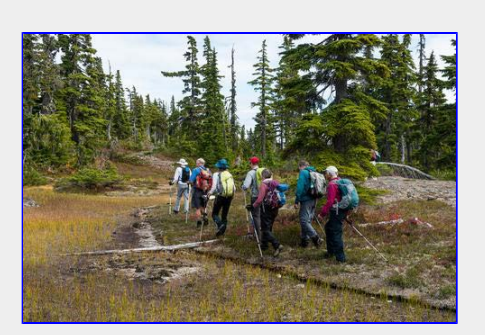
Heading back