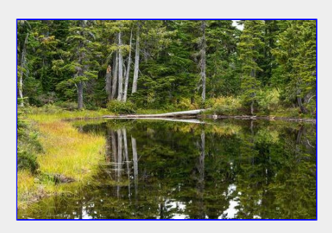
One of many tarns along our route