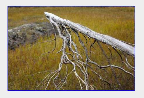
Lovely weathered wood