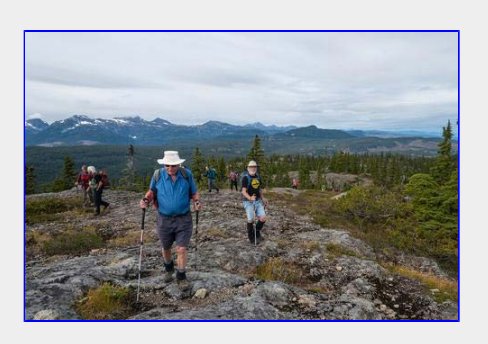
Approaching the Drabble Summit