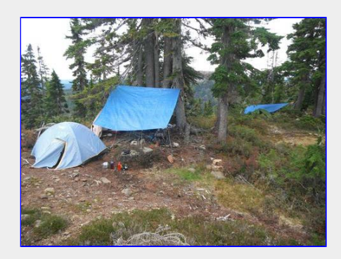
tents and tarps set up before the light rain and wind.