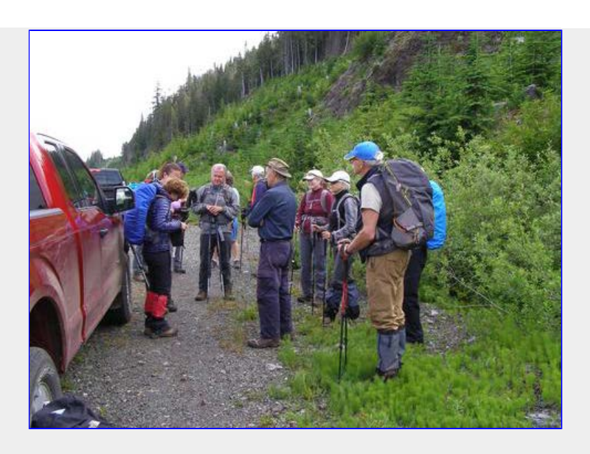
Preparation for for the beautiful hike