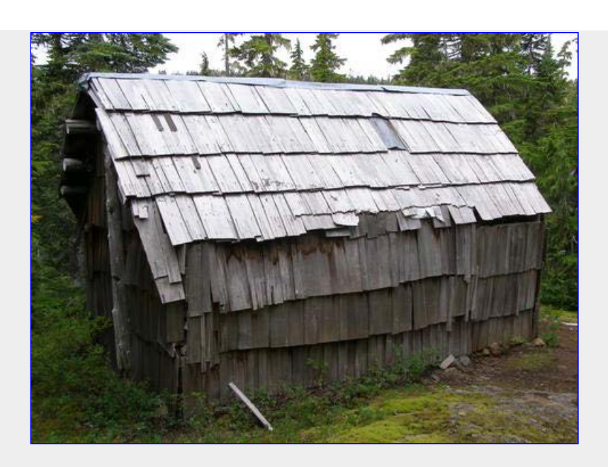
Handy shelter at the Douglas Lake