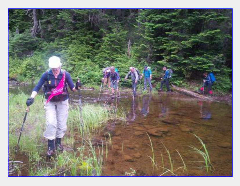
The first of many creek crossings.