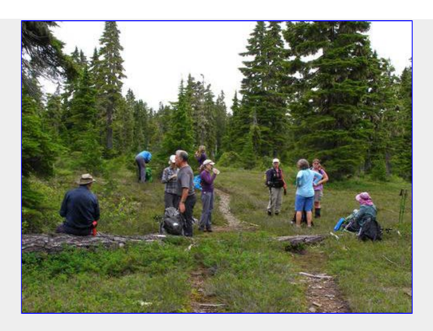
A little rest on our way to Johnston Lake