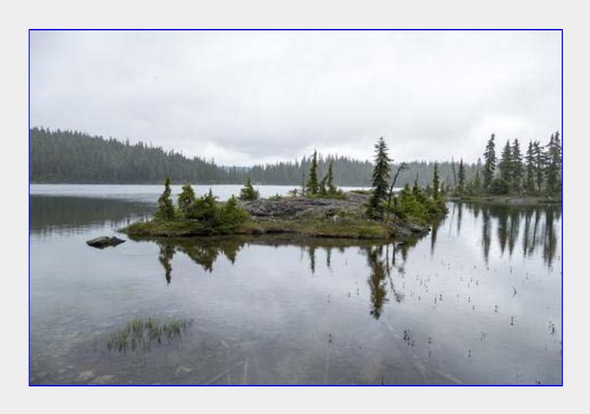
Johnston Lake