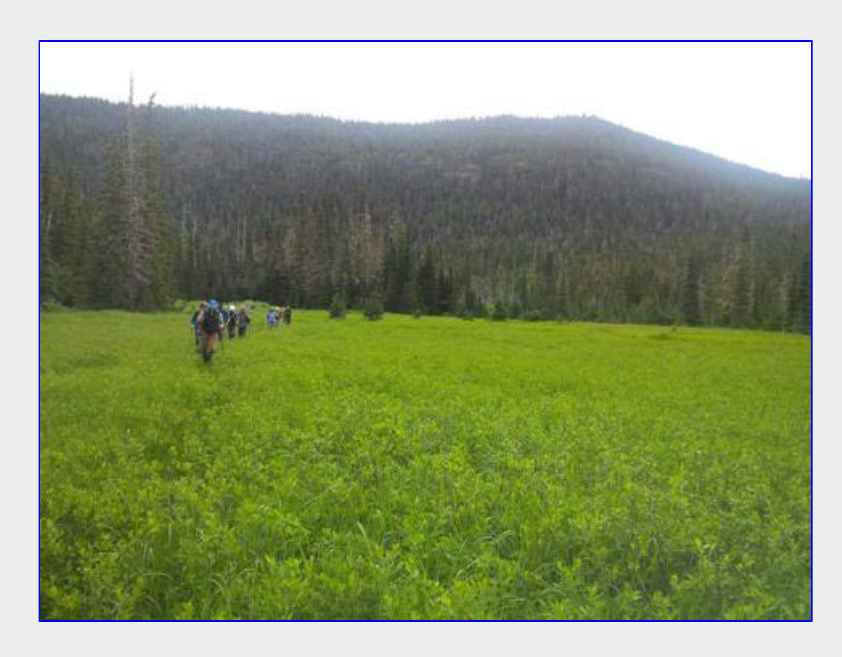
Crossing McKenzie Meadow