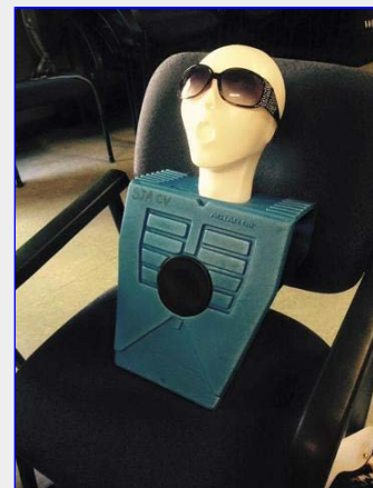
The dummy that was assigned to me!! LOL