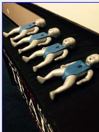
The babies for Level C