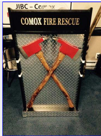
We were in their classroom!!