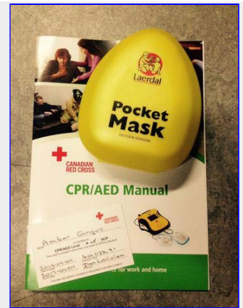
Level C departed with a book, card and a mask!! Level A also got a book and card