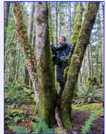
A well balanced act