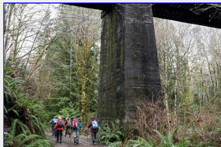
Under the railway line at the start of the trip

A nice outing which covered new terrain for most on this trip.