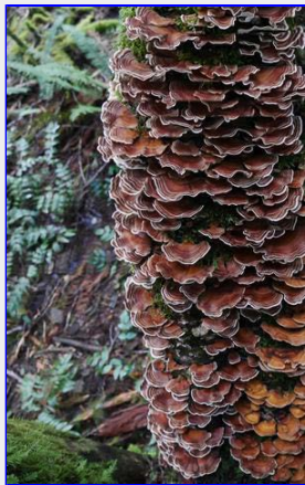
Wall of splendour