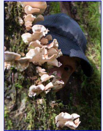
Woodland gnome peering out from the trees