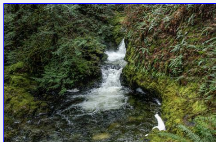
One of the lower falls