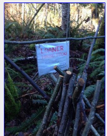
Nile Creek enhancement stands behind their work