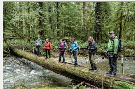
Crossing Nile Creek