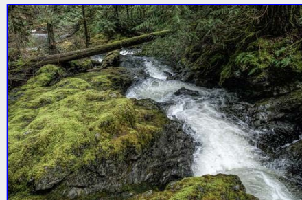
Looking down stream from one