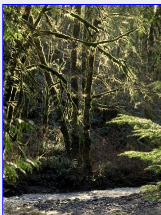
Forest Wonder