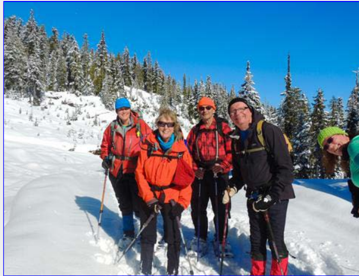
Sunny Skies and Smiles - a Great Combination! [Susan Osso photo]

Just a Bit of Elevation [Susan Osso photo]