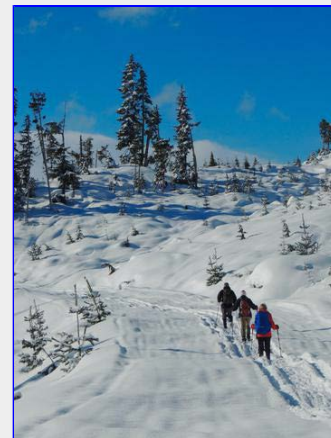
Heading Toward Paradise Creek