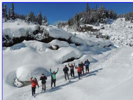
A Snow Salute