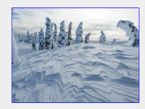
Sculpted snow