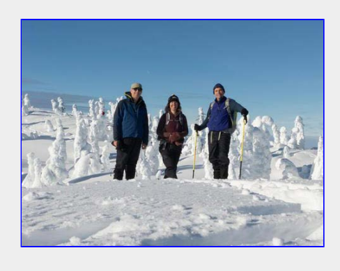
Group shot at the top