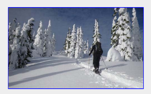
Approach walk

Three hours up, an hour on the summit, then two hours down... returning at 3:30. I had a great day with fine companions.