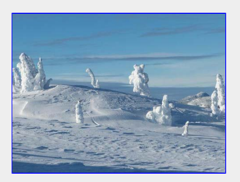
The snow mouse cometh