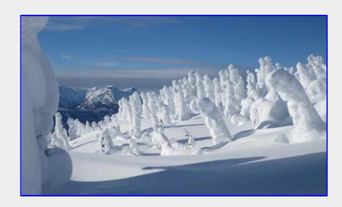
Silent sentinels