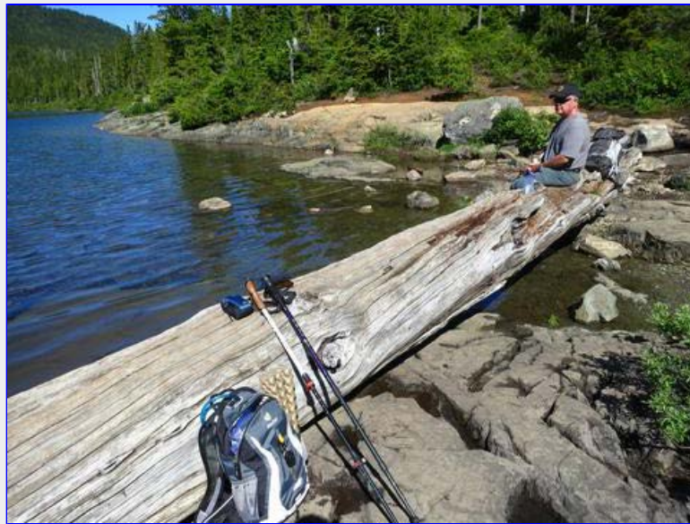
coffee break

It was the best walk ever..... blue skies, cool breeze, beautiful flowers, plenty of mud and two very humorous amigos. We laughed all the way. Unfortunately, the battery died after the 2nd photo.