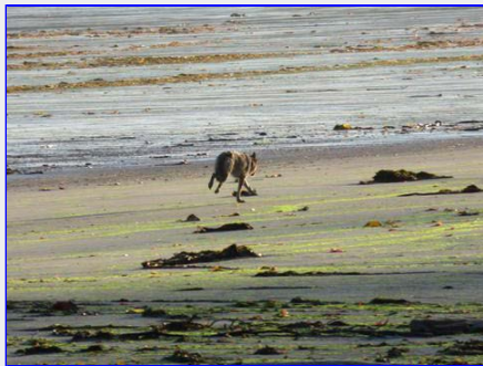
wolf running