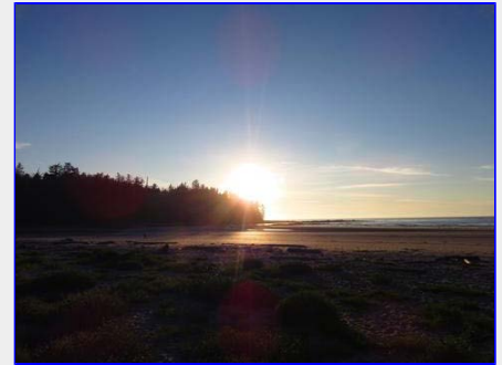
Sunset Thursday