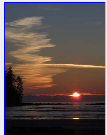
Wednesday Sunset