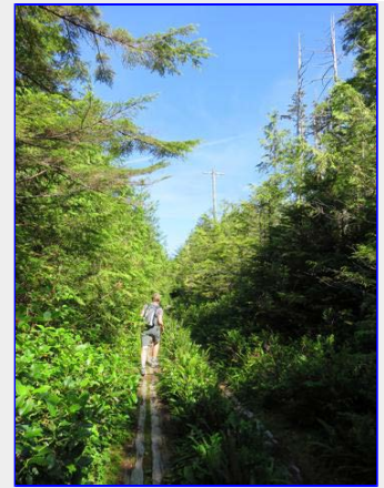
telegraph lines