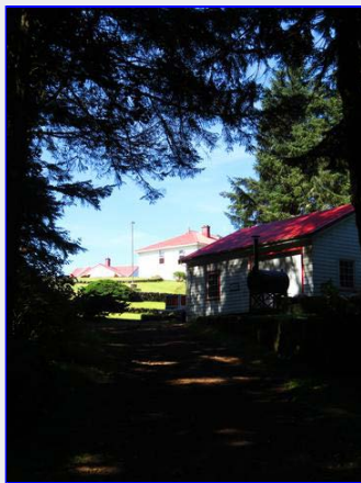
Cape Scott Lighthouse