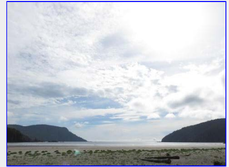
San Josef Bay