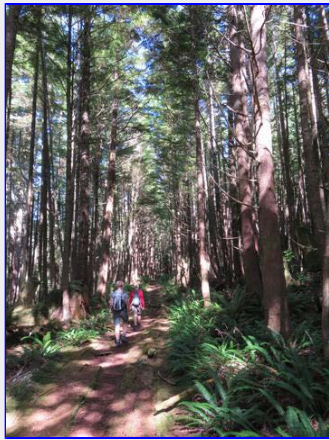
On our way to the lighthouse