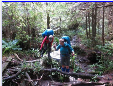
Making our way to Nels Bight