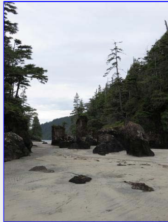
Sea Stacks