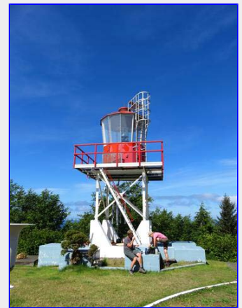
lunch break