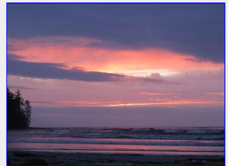
Sunset Tuesday night