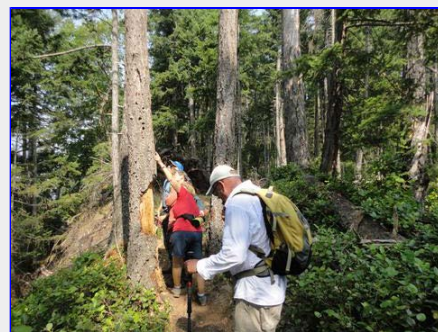
Spotting eagles along the edge of the escarpment