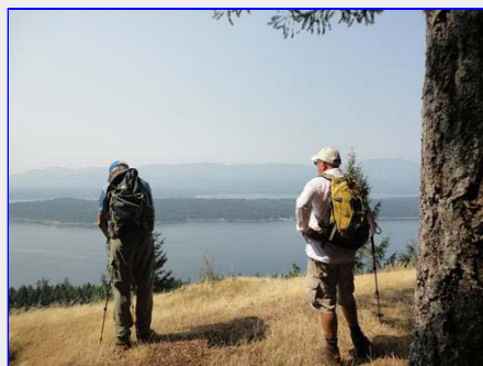
Great view over Lambert channel to Denman and the Beaufort range