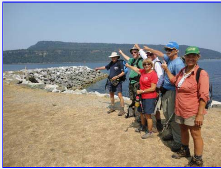
Looking back to Mount Geoffrey at the end of the trip