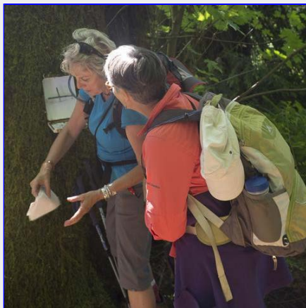
Geo Cache treasures.