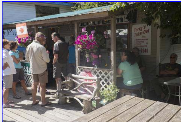
Ice Cream at Terry's Take Out.