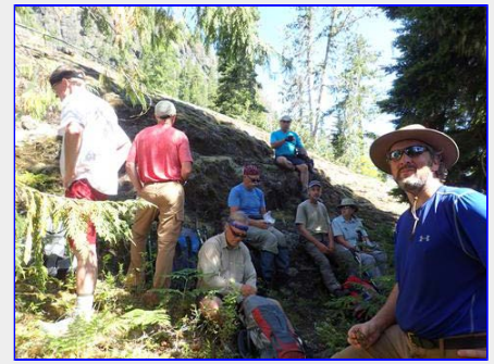
Another rest stop and self-made granola bars for energy.