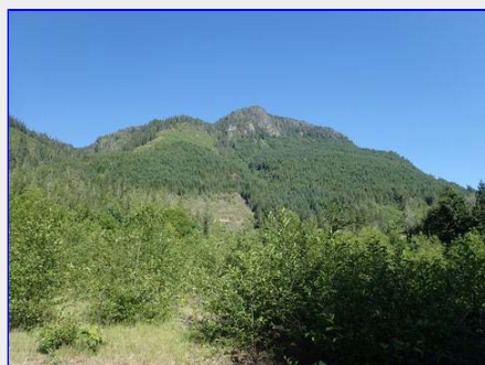
This is our goal Mtn. Ginger Goodwin