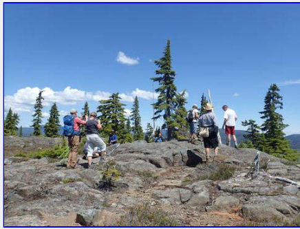
We made it. We are on the top of Mtn. Ginger Goodwin.