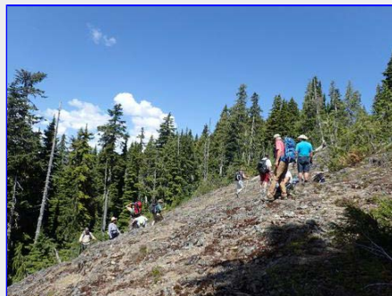
We are almost on the top!