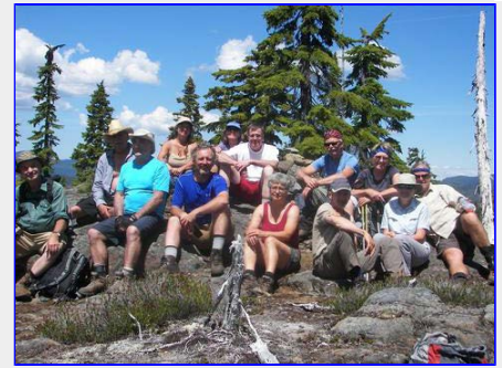
What a lovely group