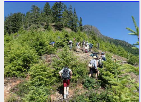
Up and up! Steep! Steep! We all have still muscle power!