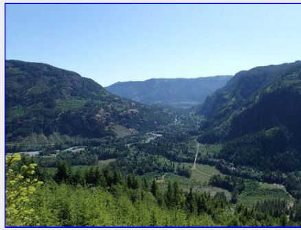
We have already a nice view to Alone Mtn. and Cruickshank River from the helicopter landing place