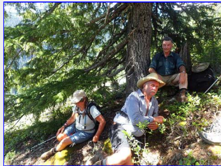
Rest and shade! It is hot!