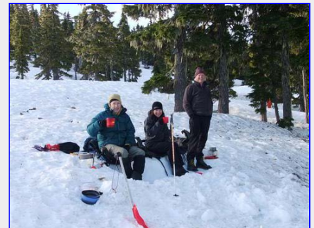
Coffee Charge for Summit Party