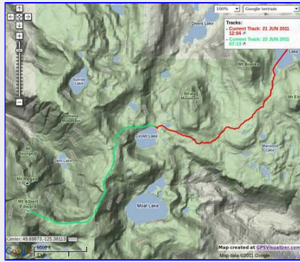
GPS track of our route