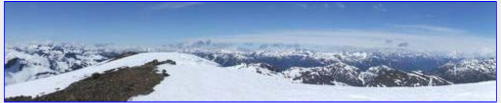
Panorama from the summit