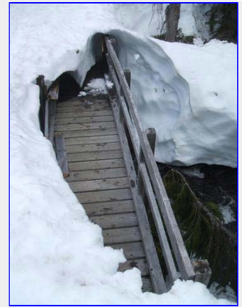
Piggott Creek bridge