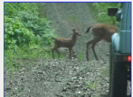
A mother deer and her fawn, on the way out.