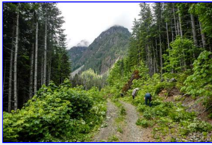
Rain kept off and we have nearly cleared to the trailhead