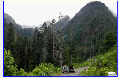
Cleared to the trailhead and now time for a quick lunch before the serious downpour started