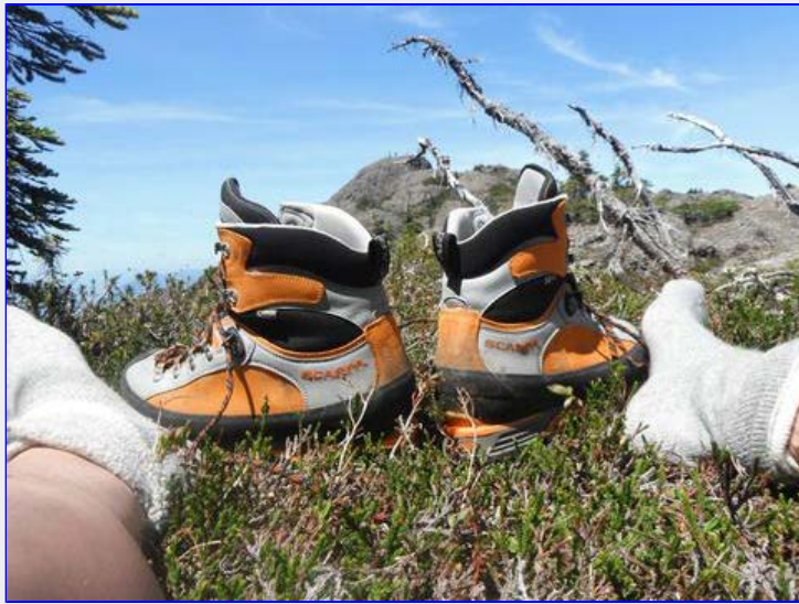
My boots and me having a break with Mt. Arrowsmith in the background.