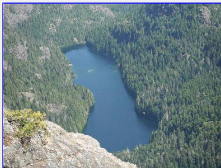
Fish tail Lake