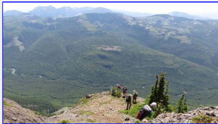
One of the wonderful viewpoints along the way back down to the trailhead.