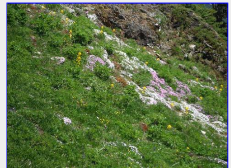
Some of the wildflowers on the sidehill.