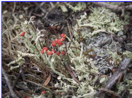
Aptly named Lipstick Cladonia