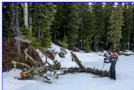
Recently broken off tree parts sitting on the still thick ice of Battleship Lake

Total time for this nearly 15 kilometre trek was just under 6 hours.