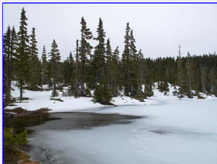
Ball Lake meltwater