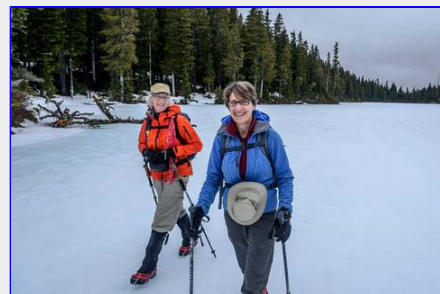
Easy walking on the lake