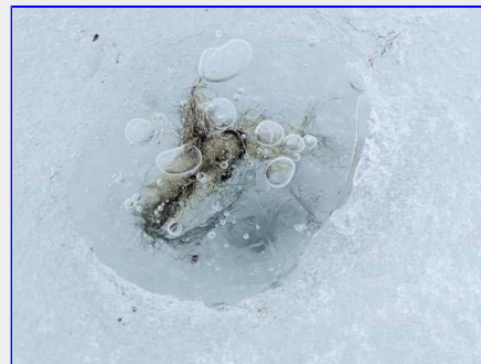
Bubbles and lichen frozen in time