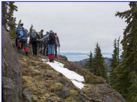
Everyone enjoyed the view of the Coastal Mountains from Croteau Ridge