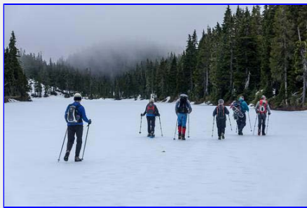
Low clouds as we near the south end of Battleship Lake