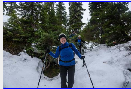
Heading down the snow filled gully from Croteau Lake