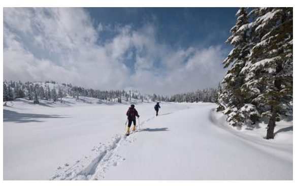
Crossing Croteau Lake