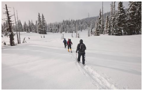
Heading across Paradise Meadows