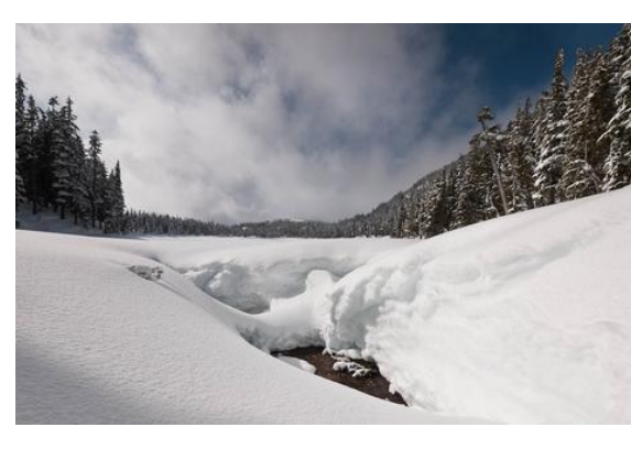
North end of Lady Lake