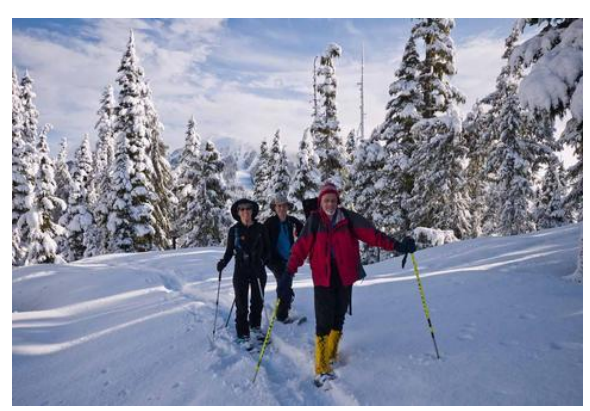
Close to Battleship Lake