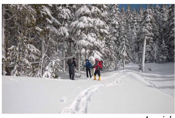
A quick stop at North end of Lady Lake