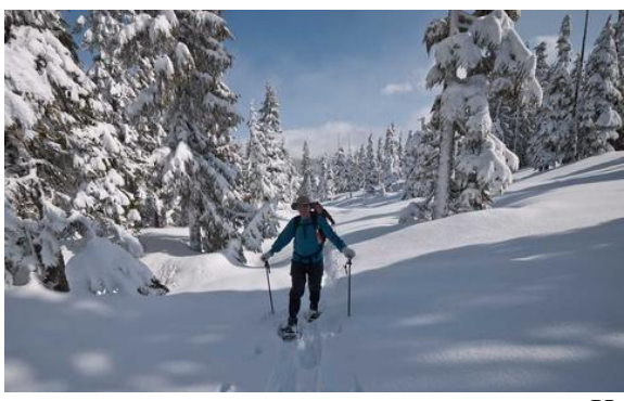
Heading up to Croteau Lake