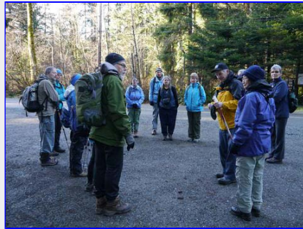
Part of the group

Perhaps the members I didn't know can add their names to the list.