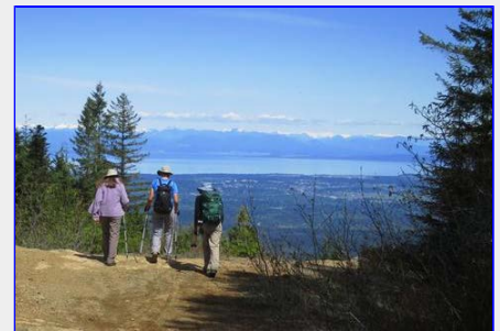
Back down in the old ski resort