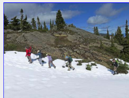
Nearing the summit