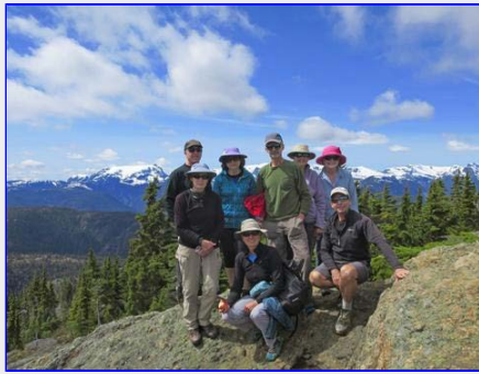
The summiteers