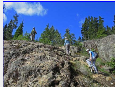
Rock on!