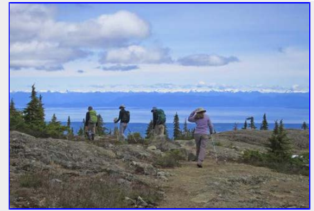
Descent and Georgia Strait view