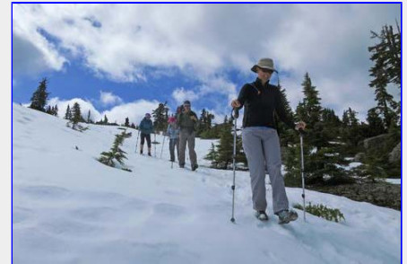
Easy descent