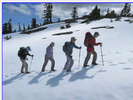
Abbey Road?