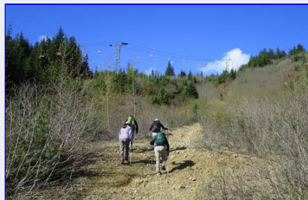
Heading up through the old ski resort