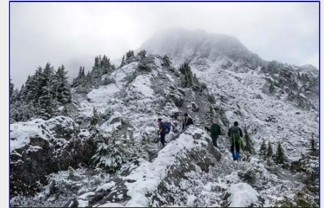
One the way up. The summit is visible through the fog