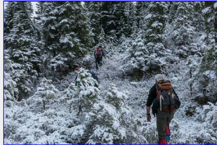
Plenty of snow on this trip