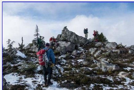
On the summit