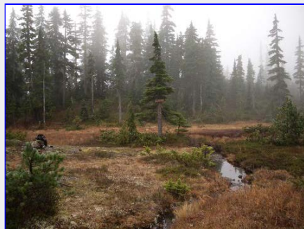
Slingshot Meadows new sign

Everyone headed back to the vehicles for 4:30 and all were back in town for dinner by 5.