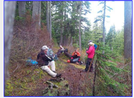
Lunch break