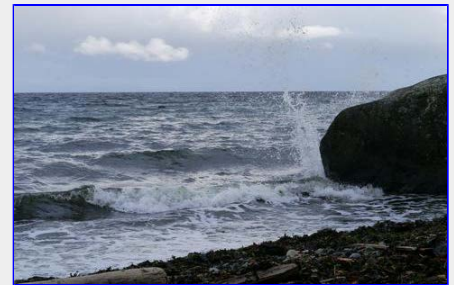
At the beach