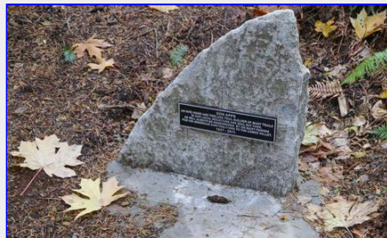
Don Apps sign closeup