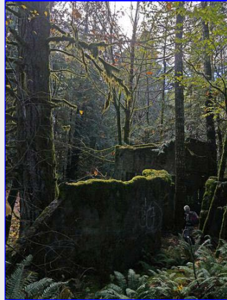
Spooky Ruins