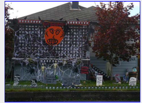
Happy Hallowe'en!