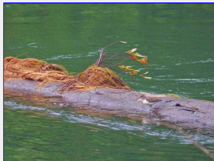
Spotted Sandpiper