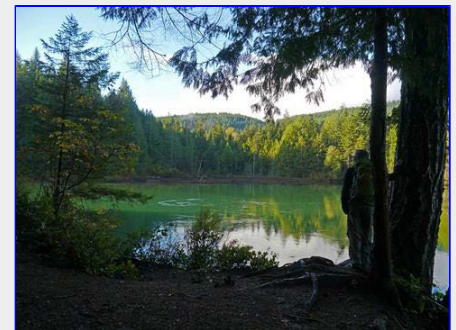
Green River