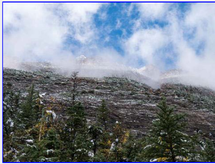
Interesting view looking up the cliffs to the peak semi-shrouded in cloud of its own making