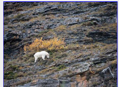
Mountain goat in a stunning winter coat.