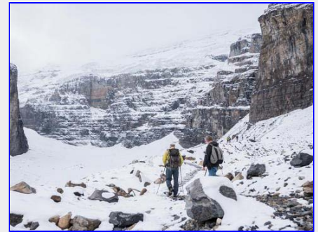
Almost to the final lookout, Mount Victoria with her hanging glaciers barely discernible from the sky