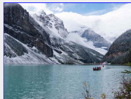
There were several canoes on the lake despite the snow including this big one