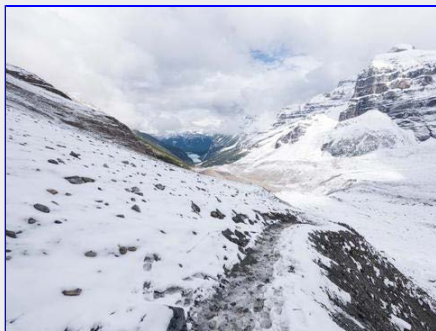
Looking at Lake Louise at the start of our return