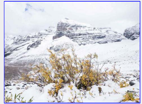
Looking over at Mount Aberdeen from the trail to the teahouse